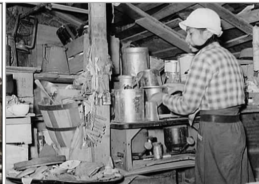
Repatriated Woman After Arriving in Mexico