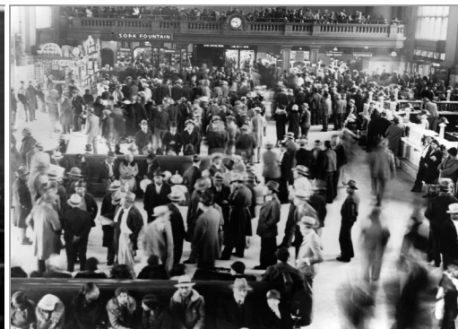
Train Station Filled With Repatriated Mexicans