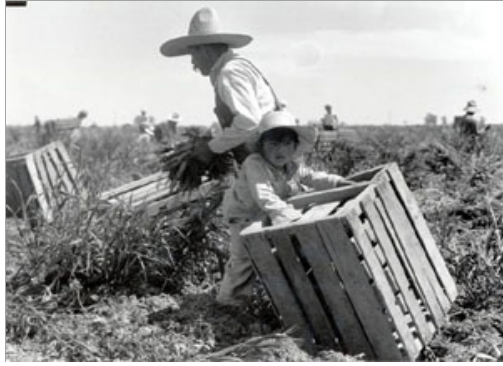
Father and Son Working in California Agriculture