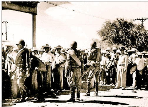
U.S. Soldiers Rounding Up Mexican Americans