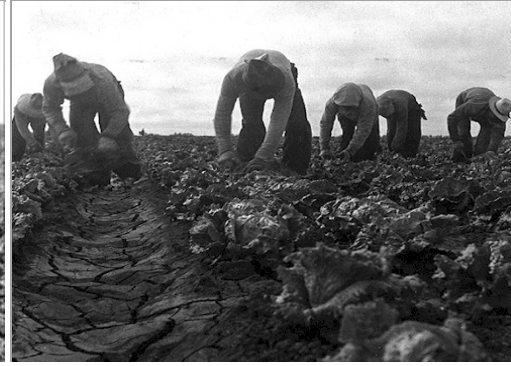
Mexican Americans in Salinas Valley