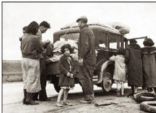
Mexican Family Voluntarily Repatriating